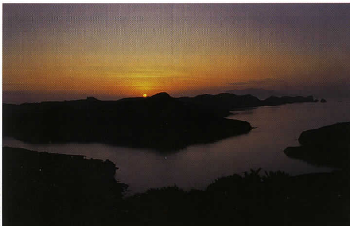
The sun sets on Great Barrier ~ on the mainland Tilley lanterns are romantic, here they are essential.

permitted to claim it. Now anyone on the island is entitled to the dole and it has attracted a new sector to the community.