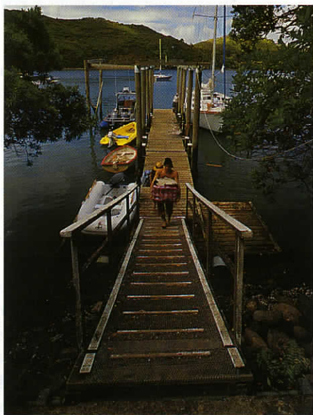
DOC's Forestry Bay wharf in Port Fitzroy~ a watering point for yachties.

Young couples on day trips look at the 'for sale' signs and ask each other what it would be like to live on the island ("for a while"). Tourists gather around property listings in