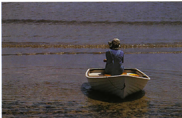
Waiting for the tide to come in at Tryphena.

lowered and the concept of 100 per cent self-sufficiency waned in the face of pragmatism. Where the idealists failed, the realists survived. Bruce is a realist, but with high ideals.