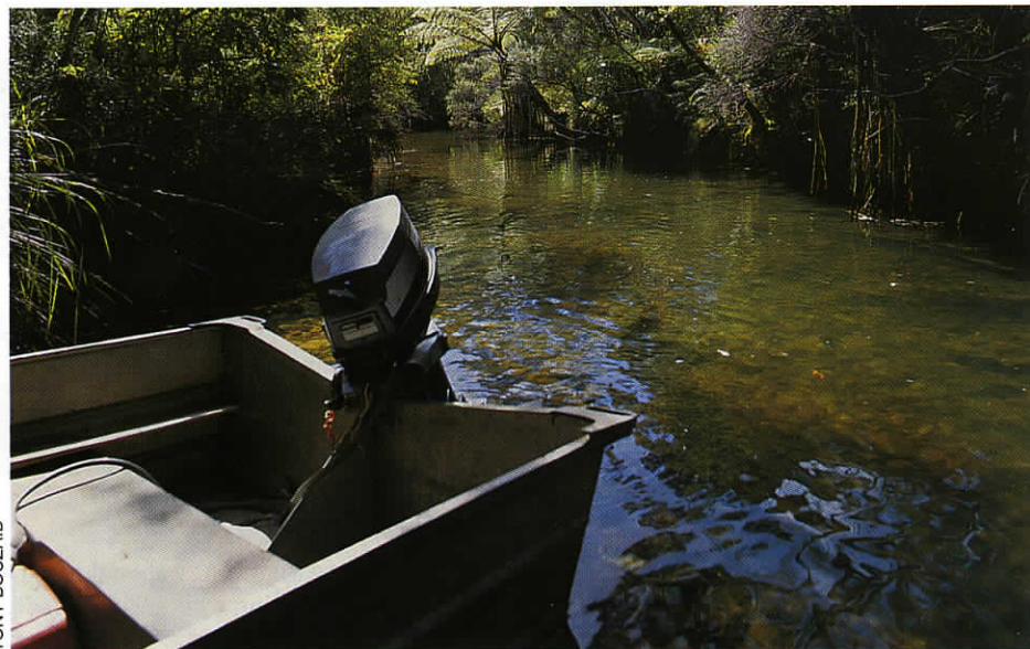
Great Barrier has numerous inlets and waterways accessible by boat.

Bro laments the coming of the unemployment benefit to the island. Prior to the late 1980s only long-term residents were