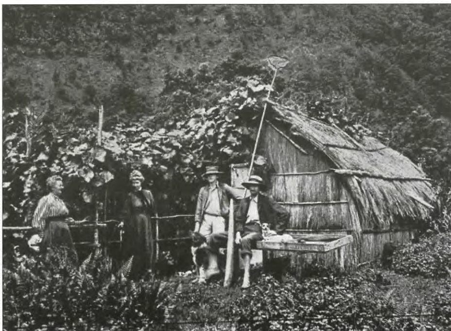
Mrs Bell with her daughter Freda and two sons, Roy and King Bell, in the vegetable patch.

A vast number of plants have been introduced to the island over the past few centuries, mostly to provide food and materials for prospective settlers – both Polynesian and European – and a full range of unexpected species litter the high side of the beach.