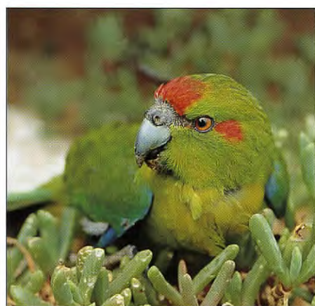
From left: Tropic bird and chick; petrel; and red crowned parakeet.

Originally, Raoul hosted massive populations of red tailed tropic birds, mutton birds, noddies, ternlets and Kermadec parakeets. Now, tuis, kingfishers, sooty terns and introduced blackbirds, starlings and thrushes are pretty much all that populate Raoul.