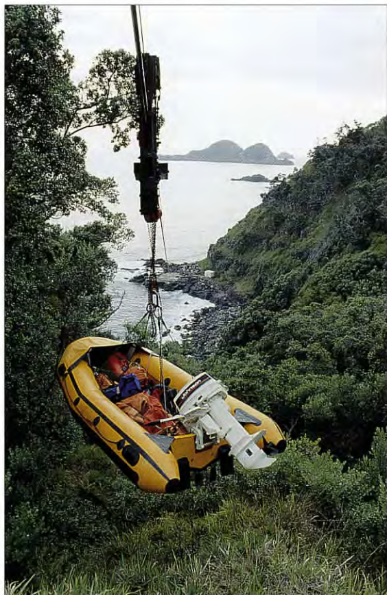
Launching an inflatable boat by flying fox. The sea is too treacherous to store the craft on the shoreline.

Alf Bacon, the island's last long-term settler left in 1938 when the New Zealand Government first established the radio and meteorological station.