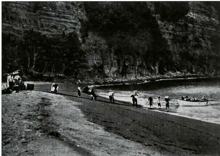
Landing stores at Denham Bay where most often the surf was heavy and dangerous.

of their existence on the remote island. It was eight months before an American whaling ship happened to pass within sight of the family's ever-ready bonfire. The Bells were at starvation point, having lived off fish, goat meat, goat's milk and taro.