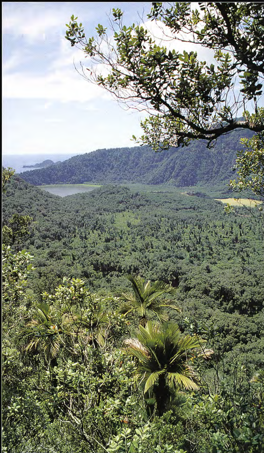
Looking across a verdant island of pohutukawa and nikau to the blue and green lakes of the Raoul Island's volcanic crater.

"This is the secret of the failure of all the settlements on Sunday Island," he wrote. "It has a most peculiar influence on the white man; the most energetic person under ordinary conditions becomes listless and lethargic after two or three weeks' residence on the Island. Every person enjoys the best of health on the Island, and it has been noticed that women folk resident there are exceptionally healthy and energetic, so that the climatic conditions do not seem to affect them adversely."